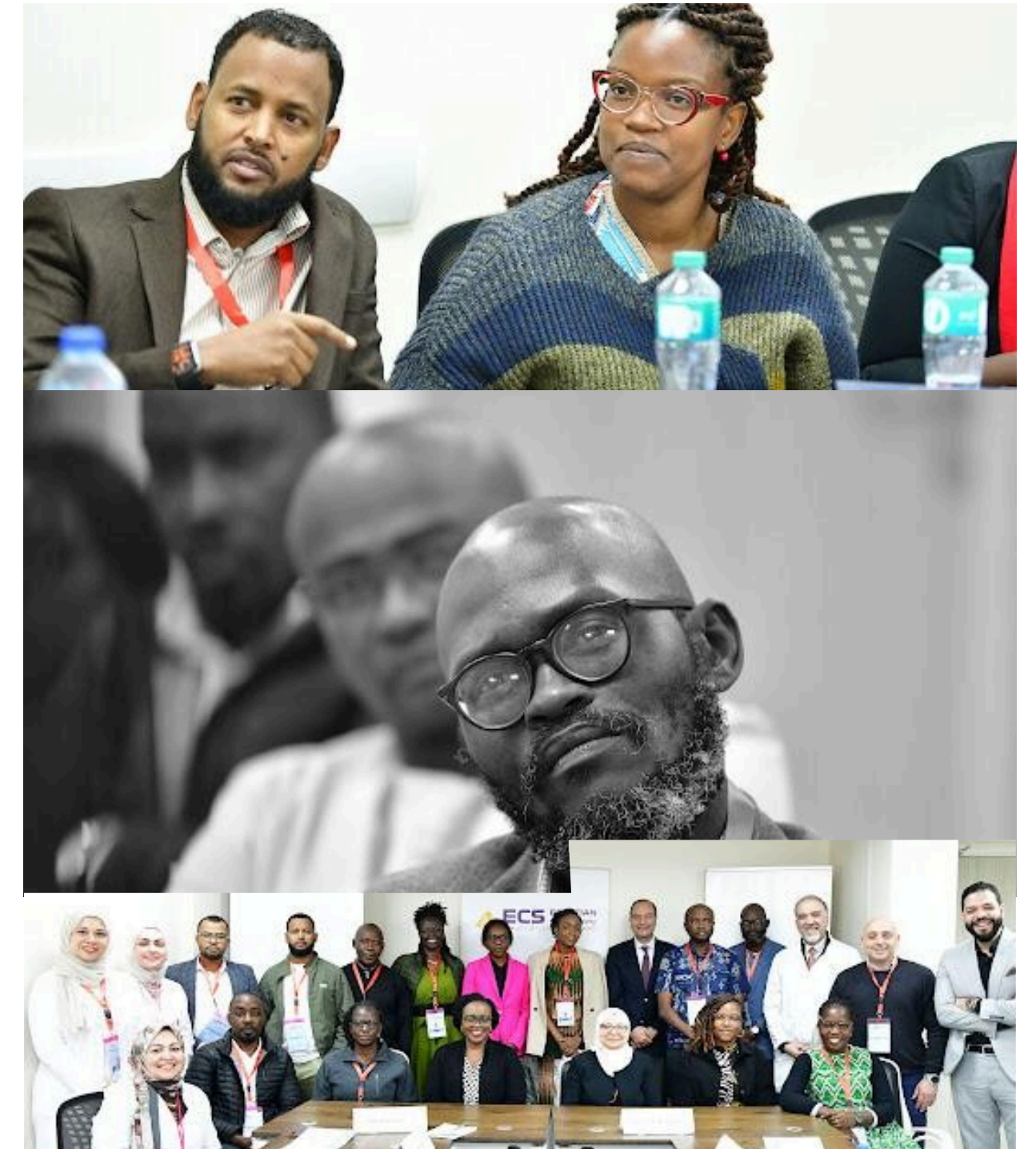
KESHO participants in the Cairo session

The focus now shifts from learning to application: how these shared insights can strengthen multidisciplinary practice and contribute to better coordinated, patient-centered care in our settings.